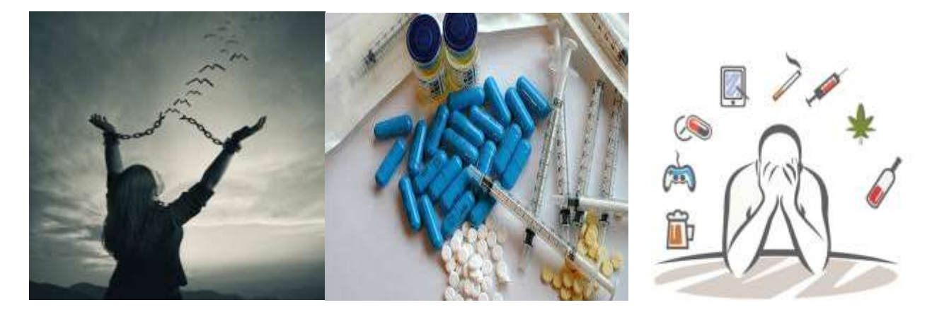
Figure 1. Advertisements showing types of harmful habits and ways of getting rid of them

Hippocrates, the founder of ancient medicine, proposed that epilepsy, many neuropsychiatric diseases, and schizophrenia occur due to the fault of parents who took alcoholic drinks during the fertilization period.