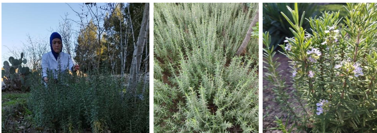
Figure 1. Rosmarinus officinalis L.

Rosemary ( Rosmarinus officinalis L.) is a perennial evergreen shrub belonging to the Lamiaceae family. The homeland of this plant is considered to be the Mediterranean countries [3]. It has a strong root system and reaches a height of 1.5-2.0 m. The length of the leaves is 1.5-3.5 cm, the width is 0.2-0.4 cm, linear, sessile, simple structure. The upper surface of the leaves is dark green, and the lower side is covered with dense hairs, grayish green. The flowers are light purple and fragrant. The seeds are brown and small. It is propagated by division of the seed, pen and cocci [4, 5].