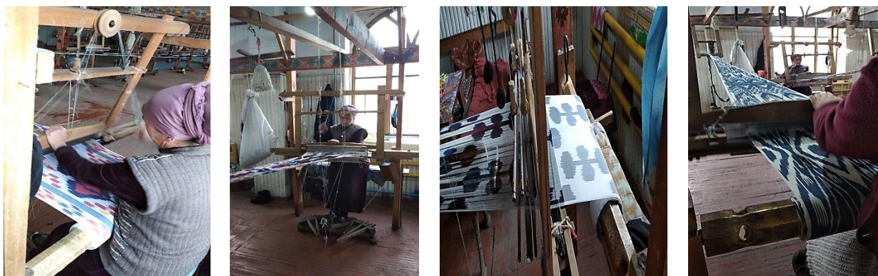
Figure 14. Fabric weaving process

The ninth cleaning step is to cut off the remaining threads in the fabric. The tenth stage is ironing, in which the fabric is pressed under high pressure and the notches of the fabric are smoothed. On the basis of the above ten stages, three types of new national adras fabrics were developed in the production conditions of “Yodgorlik” LLC in Margilan (Figure 14).