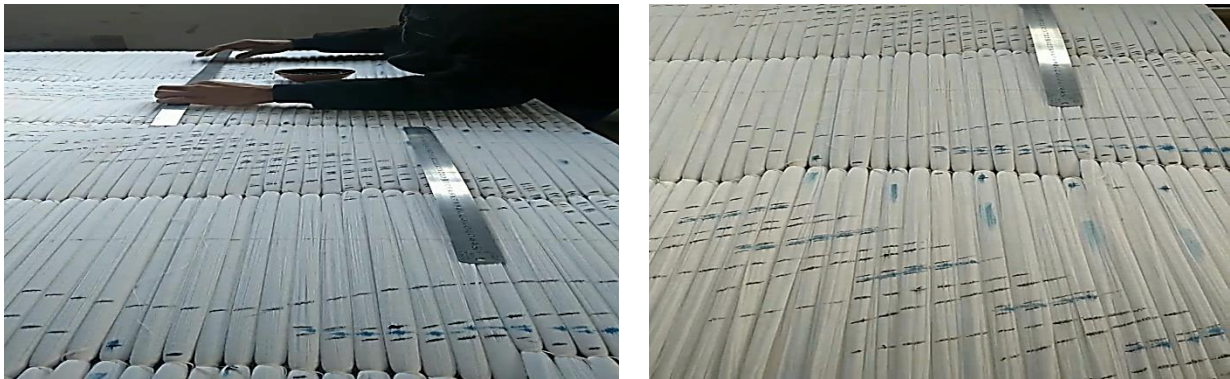
Figure 7. The process of drawing flowers

The fourth step is to draw a flower, where the folded threads are drawn by hand using a pencil to draw a black pattern on the fabric based on exact dimensions (Figure 7).