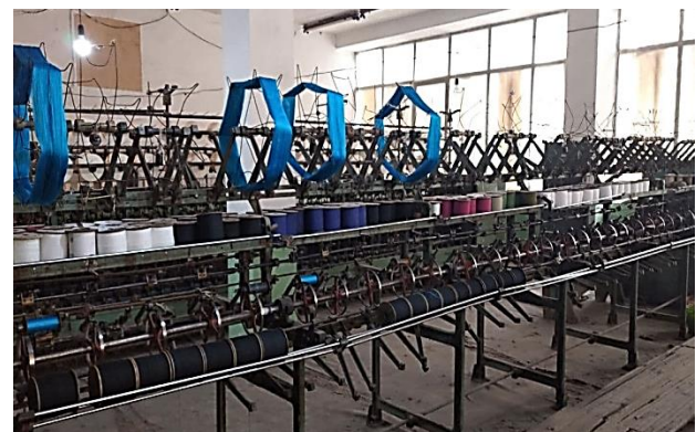
Figure 3. Kalavalovchi bench

The prepared yarns are softened and bleached. The bleached yarn is rewrapped on a spool using a loom (Figure 4).