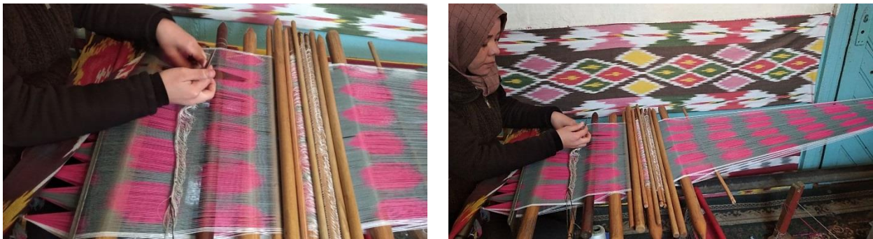
Figure 11 Weaving process for hand loom

The seventh stage is the weaving, in which the gathered yarn is passed through the flowers and the blade in the twig, divided into 2, 4, 5, 8 twigs depending on the weaving, the twisted yarn is divided into two twigs, four twigs Divides into five and eight strands, divides into five and eight strands, and threads passing through the twigs of the twigs are passed through the crochet hooks will be numbered 10, 12, 16, 20, 22 determines the width (Figure 11).