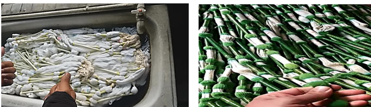
Figure 9. Dyeing process

In the sixth step, the dyed yarn is removed, the cotton thread or plastic glue on the yarn is removed, and the yarn is opened. The yarns painted on a rectangular horizontal frame are pulled vertically, and the yarns are arranged in a row, rotating and assembling the yarns (Figure 10).