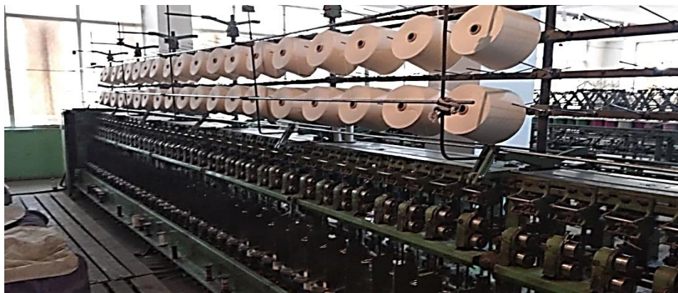
Figure 2. Spinning machine

The process of weaving the national fabric is carried out in ten stages: in the first stage, the cotton yarn is wrapped in sacks (Figure 2). If the cotton threads are single layered, they are wrapped in a single roll by twisting the roller into a coil (Figures 2, 3).