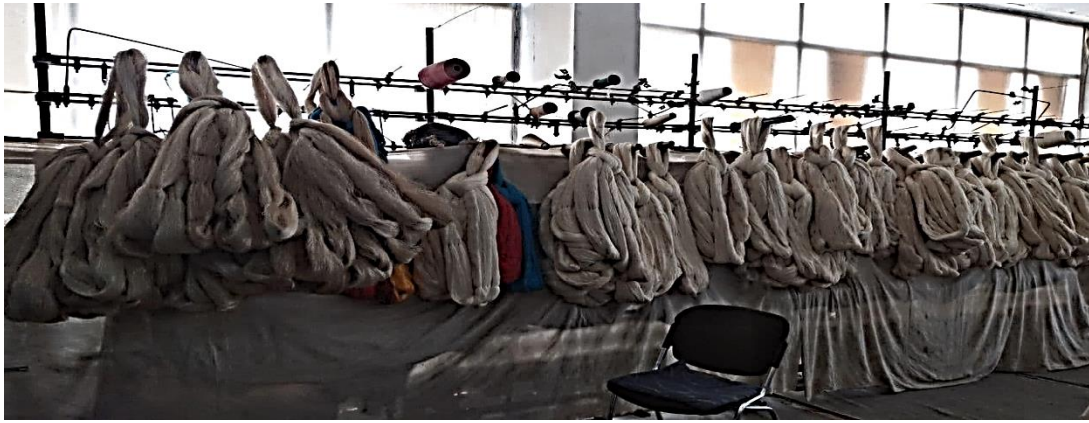
Figure 4. Bleached and softened yarns

The second stage is the rolling process, in which the cylindrical spools are wrapped separately by placing the threads separately on the frame of the spinning machine, taking into account the number of threads in the fabric and the width and length of the fabric (Figure 5).