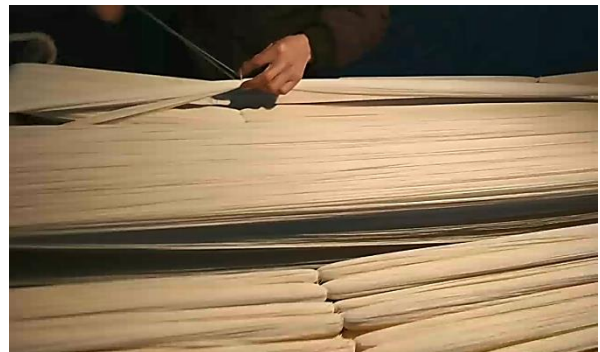
Figure 6. Folding process