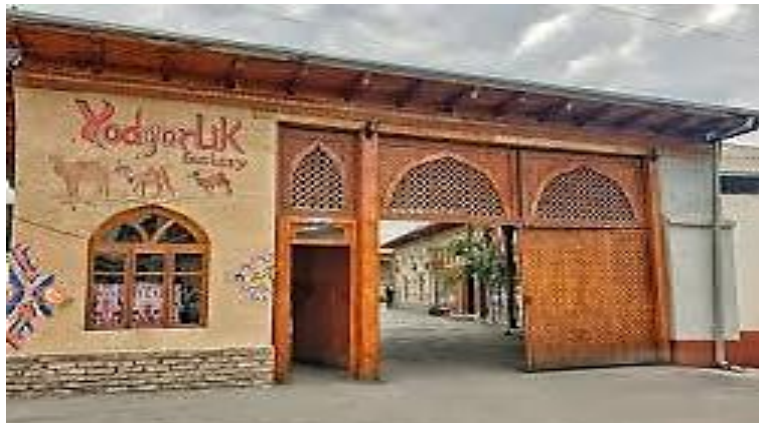
Figure 1. Appearance of Yodgorlik LLC

world for its elegant and high-quality products. The company has gradually started weaving new types of national fabrics.