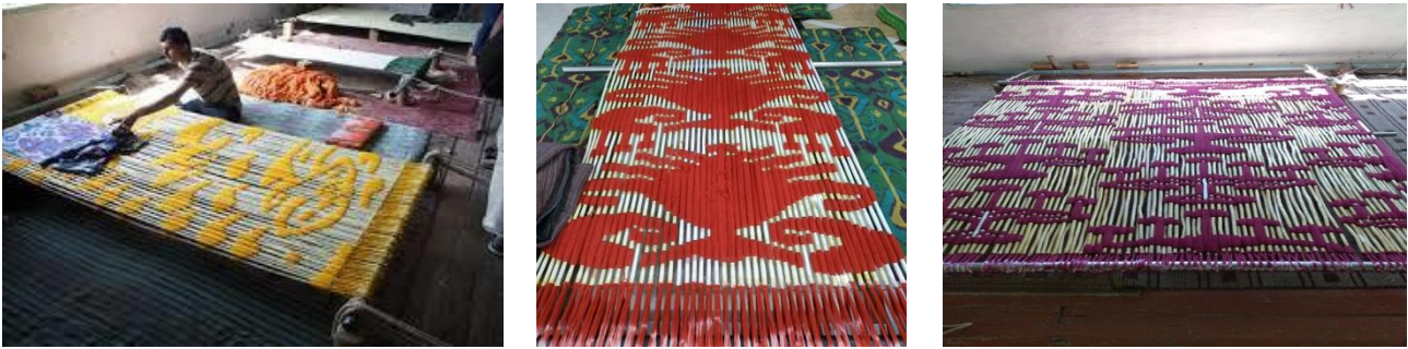
Figure 10 Spread of yarn from the dye

The seventh stage is the weaving, in which the gathered yarn is passed through the flowers and the blade in the twig, divided into 2, 4, 5, 8 twigs depending on the weaving, the twisted yarn is divided into two twigs, four twigs Divides into five and eight strands, divides into five and eight strands, and threads passing through the twigs of the twigs are passed through the crochet hooks will be numbered 10, 12, 16, 20, 22 determines the width (Figure 11).