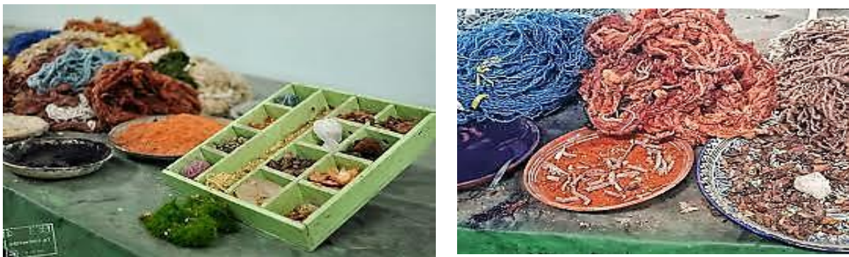
Figure 8. Applied natural colors

The fifth stage is the dyeing process, in which the threads from the flower drawing are dyed, that is, the areas to be dyed are fastened and covered with cotton thread or colorless plastic glue. The more colors used in the fabric, the more it is dyed in sequence, that is, the areas where the color is obtained are closed.