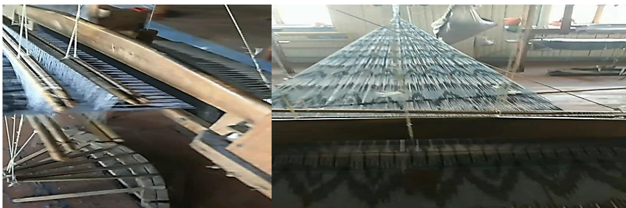
Figure 12. Hand knitting machine

The eighth stage is the weaving process, in which the yarns that have passed the spinning stage are placed on the loom. Hand and knitting machines are available. The hand loom consists of two and four, five, and eight strands, depending on the thickness of the fabric (Figure 12).