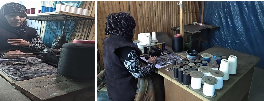
Figure 13. The process of wrapping Moki in yarn

Yarns that have passed the weaving stage are considered to be yarns in the body. The back stitch is a thread that extends across the width of the fabric and is attached to the right side of the loom. A special shuttle wrapping method is used to wrap the yarn around the moccasin (Figure 13).