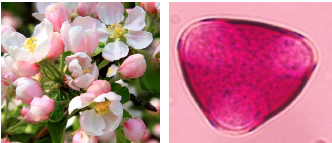
Figure 3. Malus orientalis Uglitzk.

In the Nakhchivan Autonomous Republic, the species Malus orientalis Uglitzk., belonging to the genus Malus Mill. of the family Rosaceae Adans., is found from mid-mountain zones to high mountain areas, on mountain slopes and foothills. Depending on the altitude, it flowers in April–May [1, 15]. Malus orientalis Uglitzk. is a nectar- and pollen-producing plant. The pollen grains of the species Malus orientalis Uglitzk. are monad-type and isopolar in structure. In polar view, the pollen grains belong to the tricolporate type. The colpi are oriented extending toward the poles. It is observed that pores are located in the central part of each colpus, although it can be noted that they are not very wide. The exine wall is clearly visible, and based on light microscope observations, it is determined that the surface has a weakly striate ornamentation (Figure 3).