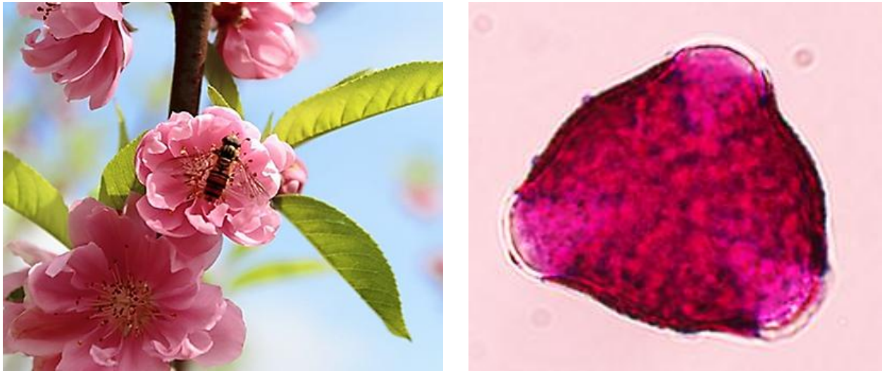
Figure 1. Persica vulgaris Mill. flower pollen

In the Nakhchivan Autonomous Republic, three species of the genus Amygdalus L. of the family Rosaceae Adans. are found (two of which are cultivated). Among these, Amygdalus communis L. is a species widely cultivated by the local population and holds significant importance for the food industry [16]. Almond kernels are widely used in the food industry due to their high protein content and richness in amino acids [17]. Additionally, almond pollen is distinguished by its high content of proteins, lipids, phenolic compounds, vitamins, and minerals. In a study conducted by Huseynova A. et al., the total flavonoid content in the pollen of almond ( Amygdalus communis L.) was determined using spectrophotometric methods to be 10.29 \pm 1.16\% [9]. Furthermore, the early spring flowering of the almond plant and its active pollination by honeybees indicate that almond pollen is one of the first food sources for bees during the spring season [2].